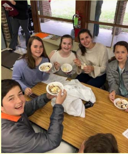
Religious Education enjoys Ice cream sundaes after Confessions and Adoration