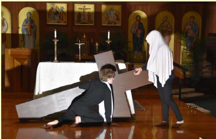
LIVING STATIONS AT ST. IGNATIUS