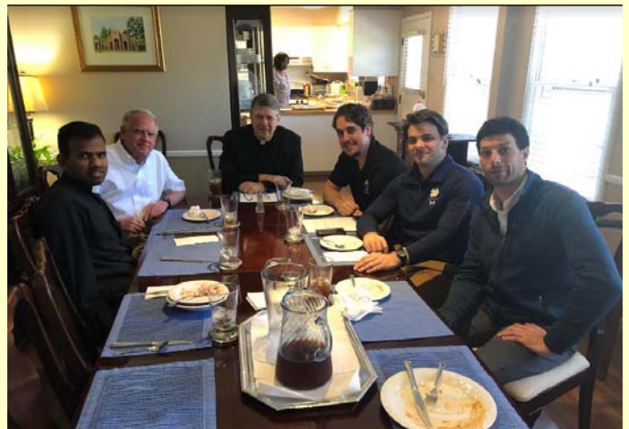
LUNCH WITH SEMENARIANS