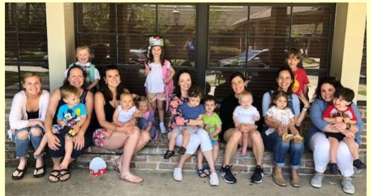
ANOTHER GREAT YEAR FOR THE MOMNIPOTENT WE WILL START AGAIN IN THE FALL