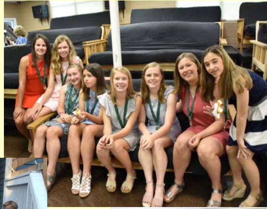
ORDER OF ST. IGNATIUS RECEPTION