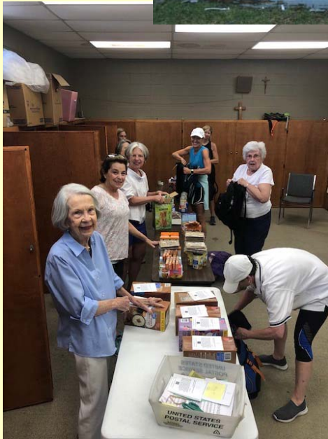
THANK YOU TO ALL WHO VOLUNTEERED WITH THE BACKPACK MINISTRY THIS YEAR!