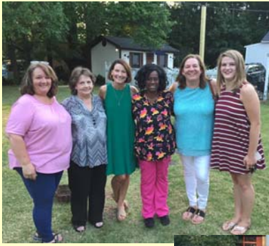
WHAT A GREAT SCHOOL YEAR AT THE EARLY LEARNING CENTER