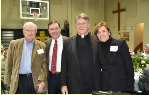
PARISH COUNCIL PARTY