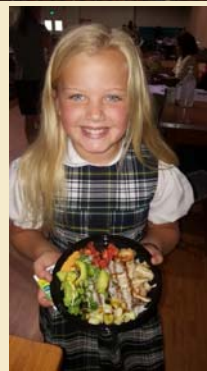
MAMA BOWLS NOW AT MID DAY CAFE. YUMMY!