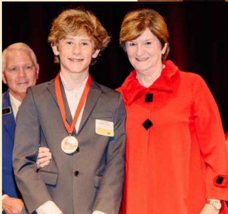
ST. IGNATIUS' RED RIBBON WEEK REP AT DRUG EDUCATION MEETING