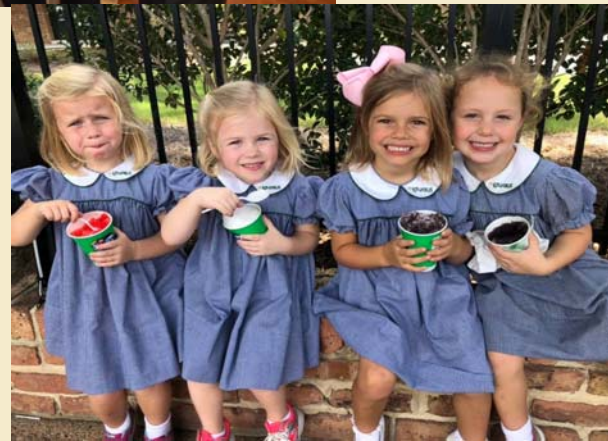
SLUSHIES FOR STUDENTS!