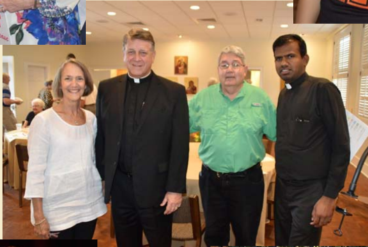
JOIN US FOR LOYOLA CLUB WHICH MEETS THE FIRST WEDNESDAY OF EACH MONTH