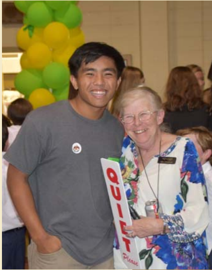
ST. IGNATIUS ALUMNI VISIT BEFORE MCT HOMECOMING WEEKEND