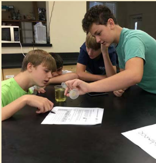
WHAT IS HAPPENING IN THE SCIENCE LAB