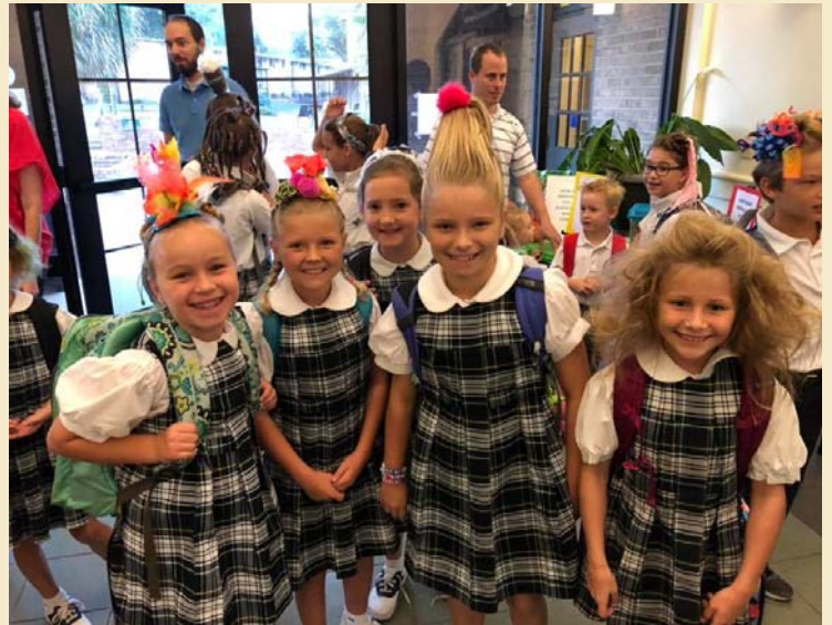
CRAZY HAIR DAY