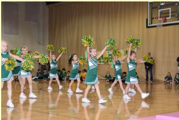
Thank you to all the grandparents that attended the Grandparents Mass and Reception!