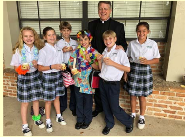
Ice Cream Challenge with St. Ignatius 5th graders