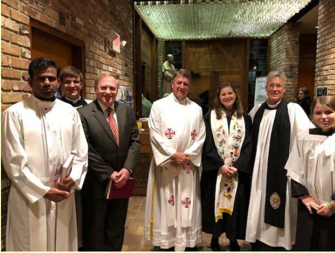
THANK YOU TO ALL WHO ATTENDED THE ECUMENICAL SERVICE AND SHOWED SUPPORT FOR OUR COMMUNITY