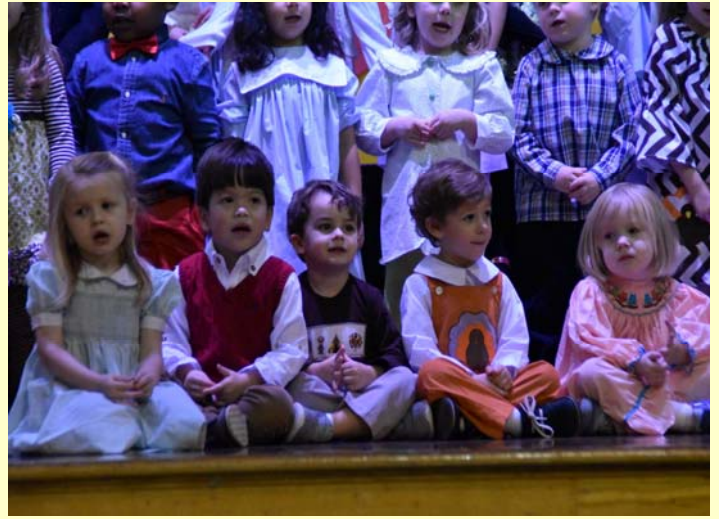
THE PK THANKSGIVING PLAY WAS A WONDERFUL WAY TO START THE SEASON