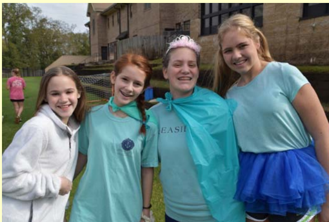
AMERICAN HEART ASSOCIATION HOUSE KIDS HEART CHALLENGE