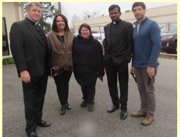
40 DAYS FOR LIFE ROSARY