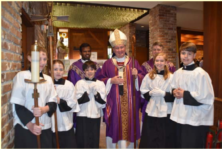
ARCHBISHOP RODI CELEBRATES MASS AT ST. IGNATIUS ON ASH WEDNESDAY