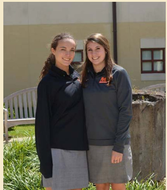
Two St. Ignatius Alumni have been recognized by The National Merit Society!